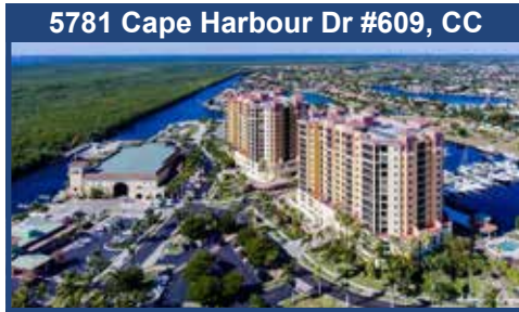
5781 Cape Harbour Dr #609, CC