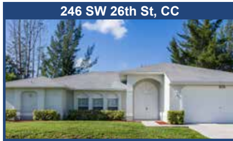
246 SW 26th St, CC