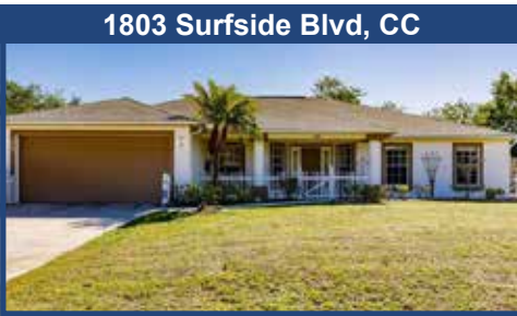
1803 Surfside Blvd, CC