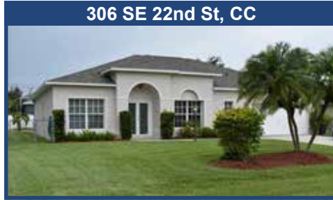
306 SE 22nd St, CC