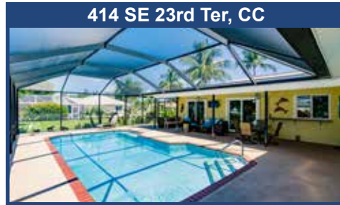
414 SE 23rd Ter, CC