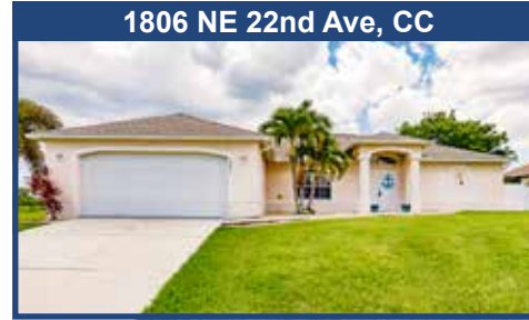
1806 NE 22nd Ave, CC