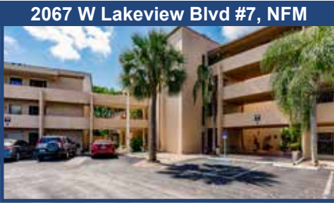
2067 W Lakeview Blvd #7, NFM