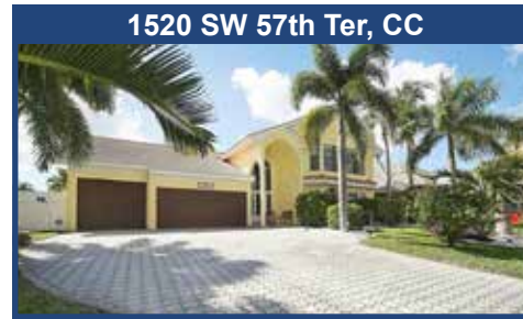
1520 SW 57th Ter, CC