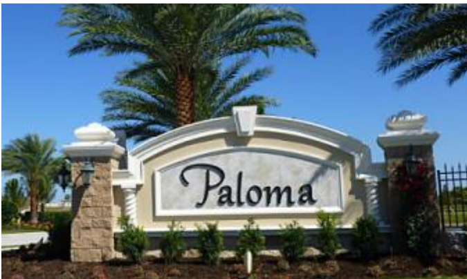
Paloma – Bonita