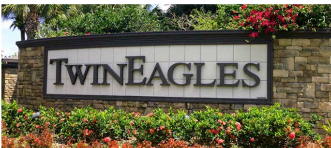
TwinEagles – Naples