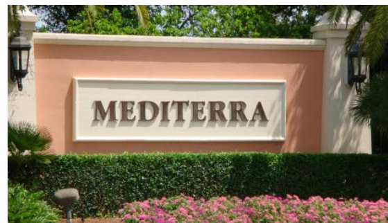
Mediterra – Naples