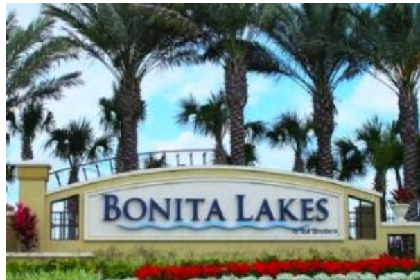
Bonita Lakes – Bonita