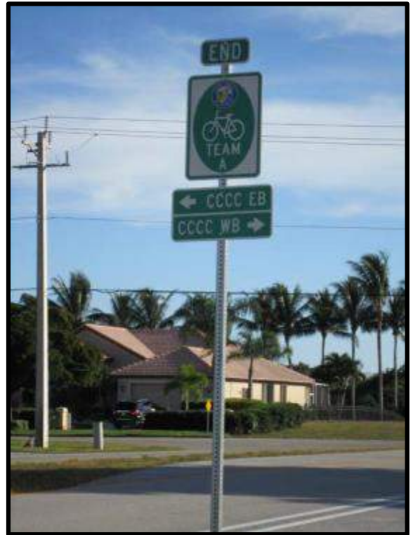
Team Aubuchon sponsors a popular bike route in SW Cape.

Pick up a bicycle trail brochure at our Real Estate Information Center, 1811 Cape Coral Pkwy, 239.540.0826.