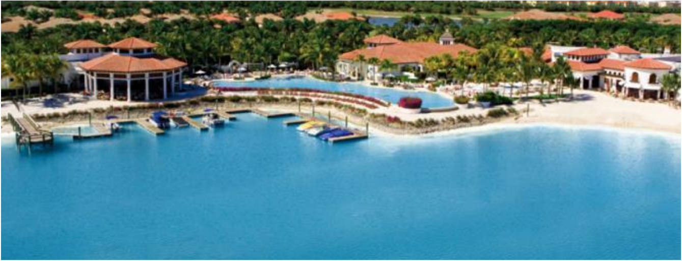
Mirasol – Bonita