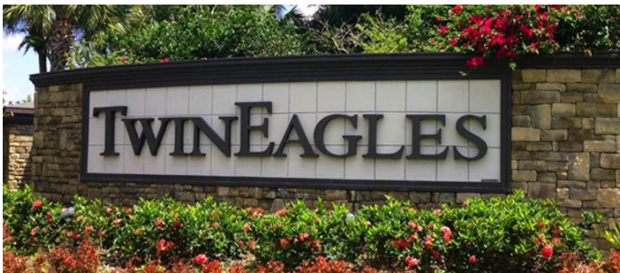
TwinEagles – Naples