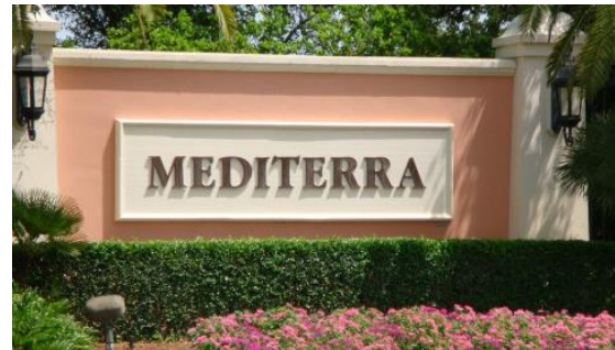
Mediterra – Naples