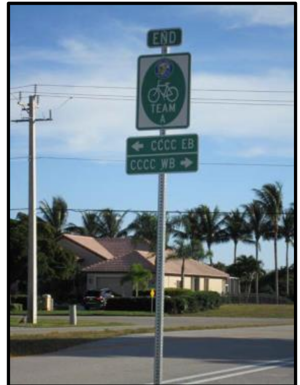
Team Aubuchon sponsors a popular bike route in SW Cape.

Pick up a bicycle trail brochure at our Real Estate Information Center, 1811 Cape Coral Pkwy E, 239.540.0826.